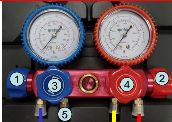
grefac 4-Way Manifold Set