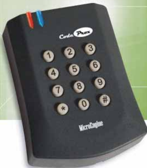
XP-SR200K-N - Standalone Proximity with Keypad Access System