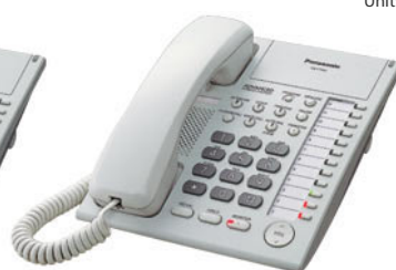
■ KX-T7750 Monitor Unit