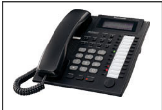
Units available in Black and White