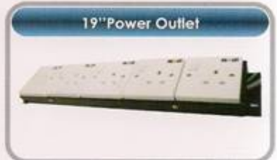
19" Power Outlet

Useful for cable management, measuring 100 mm wide, and available in metre lengths.