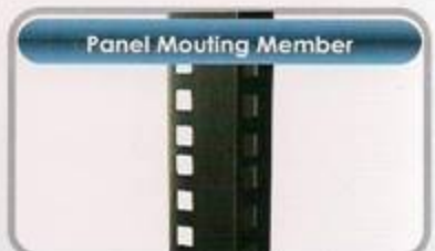
Panel Mounting Member

Adjustable feet is for levelling the rack after it has been placed in position. Castor Wheels available in set of 4.