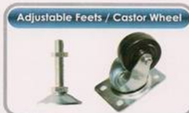
Adjustable Feet / Castor Wheel

A13 Amps power outlet allows to mount on the 19" panel mounting.