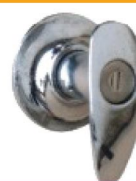
Outdoor Lock ( Optional )

Stainless Steel lock for outdoor Cabinet.