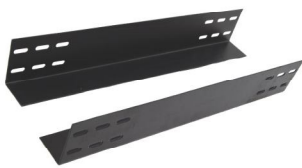
Chassis Runner ( CR430,630,730 )

Commonly used for supporting equipment. Available in 430mm, 630mm, 730mm.