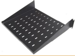
2U Cantilever tray

Can be used upturn or reverse, depending on choice.