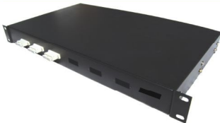
1U Fibre Panel ( Optional )