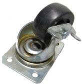
Castor Wheels with Stopper