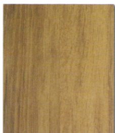
D-2682 COUNTRY OAK