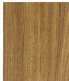
D-9021 NOCKSTEIN WALNUT