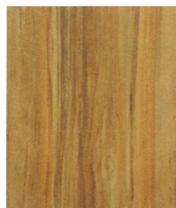
U-1673 LIGHT HICKORY