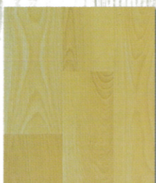
D-1551 REGAL MAPLE