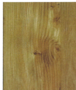
U-8610 VALENCIA PINE