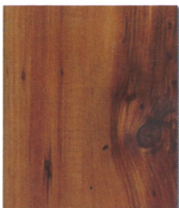
U-4137 MONTANA PINE