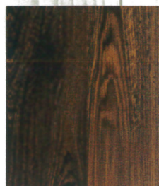
D-1726 ANDES PANGA