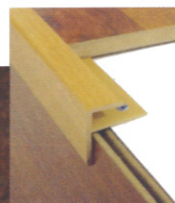
Stair Nose (F)