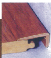
END Border L