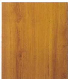
D-6026 NAPOLI ALDER