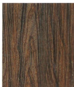
U-1609 DARK WALNUT