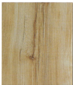
U-8045 SNOW OAK