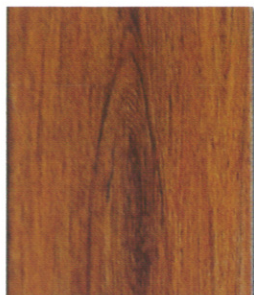
U-7021 LUSIO PINE