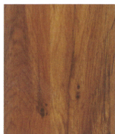
D-2106 MEERSBURG ROSEWOOD