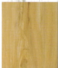
D-1660 CASTILLO SPRUCE

Dynaloc Flooring offers great looks at affordable price. It's also durable and easy to maintain. The natural beauty of flooring can bring warmth and character to any room and suit any decor.