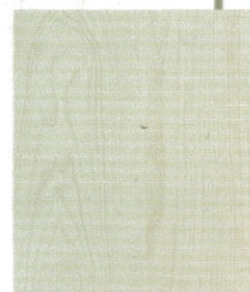
D-2213 WHITE OAK