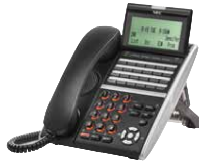
DT430 & DT830