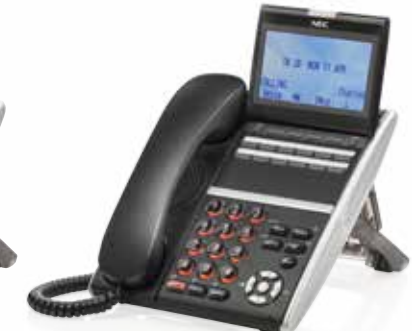
DT830CG Colour Display