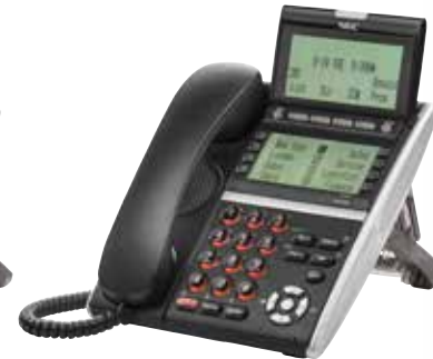
DT430 & DT830 DESI-less