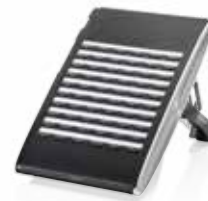
60-line DSS Console