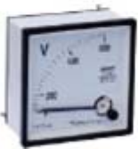
NP series panel meter

1.1 NP series square panel meters are electromagnetic type, adopting repulsive construction. The meters are consist of measuring mechanism and indicating device., with casing adopted by flame-retardant ABS engineering plastics, safe measure terminals, high-efficiency connection type, and adopted by printing dial & transparent glass cover. The whole looks beautiful and provides an open view.