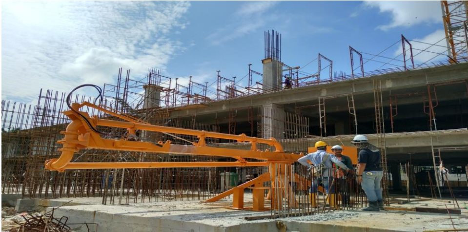
Figure 1: Summit World Resources' KRV10 concrete distributor with leg folded for easy storage