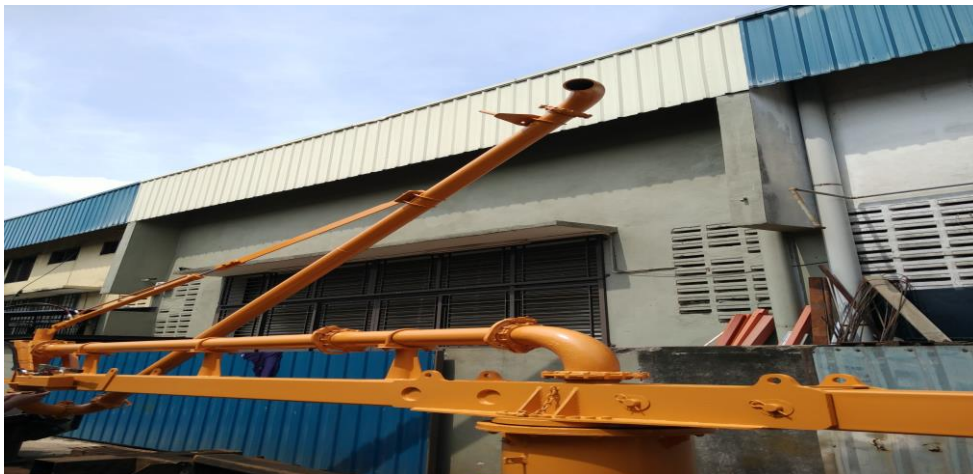
Figure 3 Summit World Resources' KRV10 Support lifting up to 3.5m