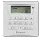
DSLM8 Wired Controller