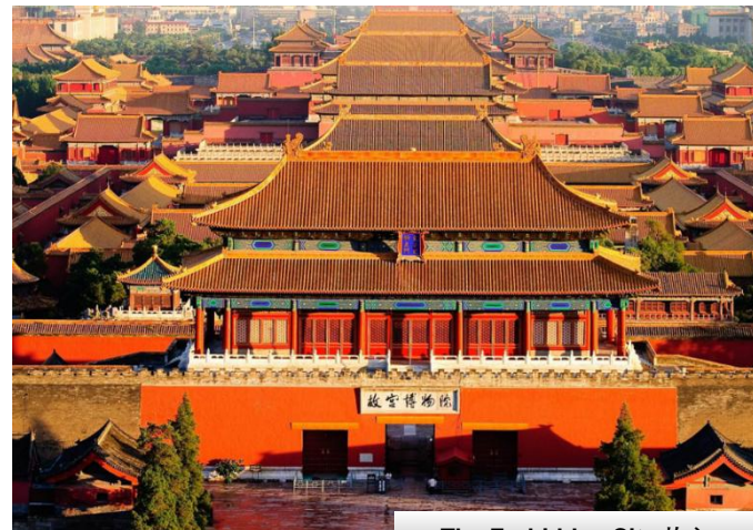
The Forbidden City 故宫

Taste of old Beijing, Beijing Roasted duck 老北京风味; 北京烤鸭