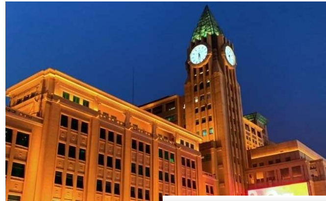
Wangfujing Street 王府井大街