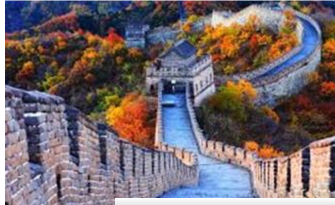
Mutianyu Great Wall Of China 慕田峪长城