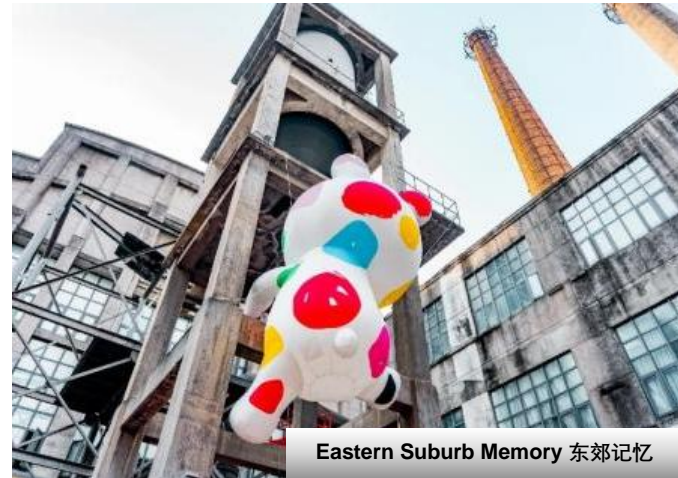
Eastern Suburb Memory 东郊记忆