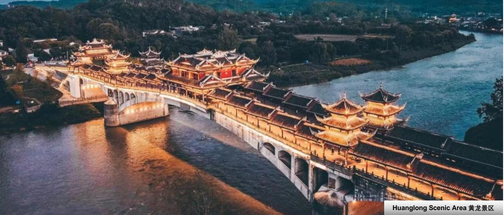
Huanglong Scenic Area 黄龙景区