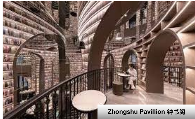
Zhongshu Pavillion 钟书阁