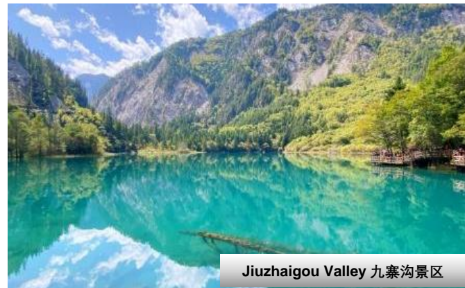
Jiuzhaigou Valley 九寨沟景区