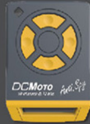
Multi Function Remote Control