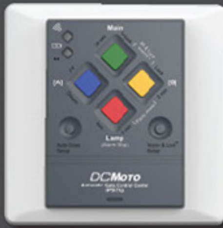
Wireless Multi Function Keypad With Anti-Spy Technology