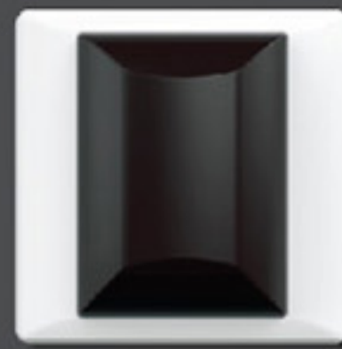
Infrared Safety Beam (Optional)