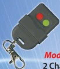
Model: 712 2 Channel Remote Control