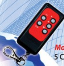
Model: 715 with Alarm 5 Channel Remote Control