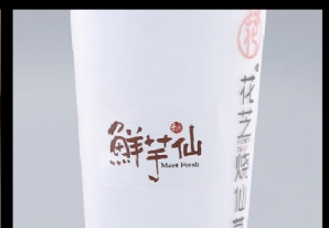
Stik the transfer film ②