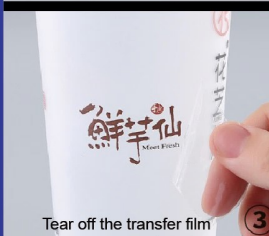
Tear off the transfer film ③