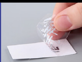
Separate the film-A and B apart ①