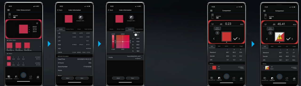
Display Measurement Figures [L*a*b, L*C*h, LRV (Light Reflectance Value), HEX (sRGB), RGB & CMYK] Graph Display (Gamut outer line, display gamut in/out)

Get all the colour-related information including the measurement figures and similar colours via the SD-10 app in both graphics and text. With gamut in/out profile, businesses can know immediately if the identified colour is printable or not.