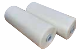
Authorized Revo Film