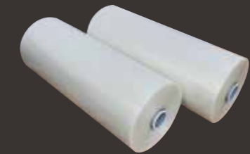
Various Film Lineup