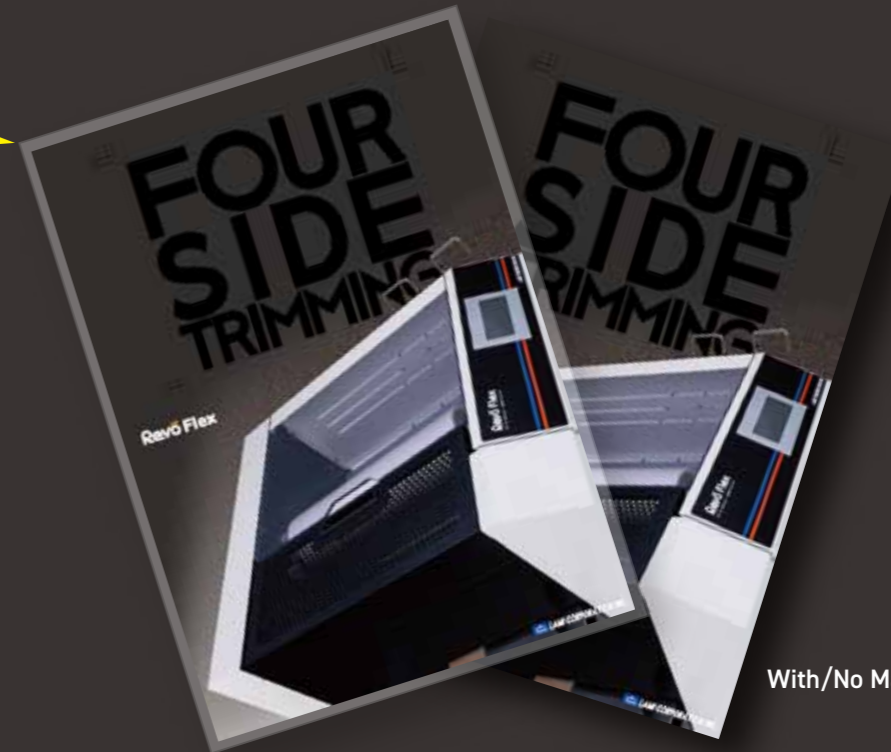
With/No Margin Function