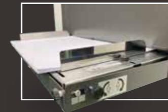
Sheet Feed Skew Adjustment