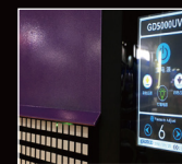
Easy-operating touch screen