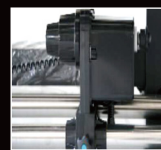
Regular take-up, stable media feeding and take-up