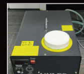
Water-cooling UV lamp