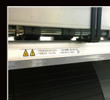
Anti-static device equipped to fight against static and ensure accurate ink droplets positioning