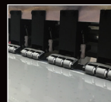
More stable feeding system with 3-foot pinch rollers