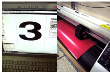
Design & Cut