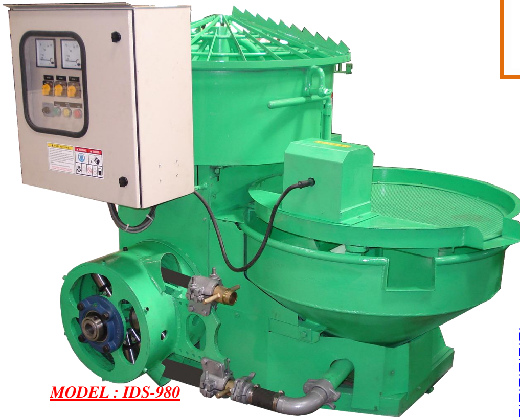
MODEL : IDS-980