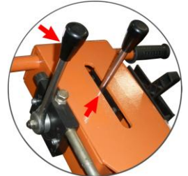
Operation Lever (TKR-600S)