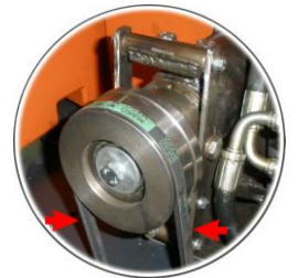
Heavy Duty Clutch