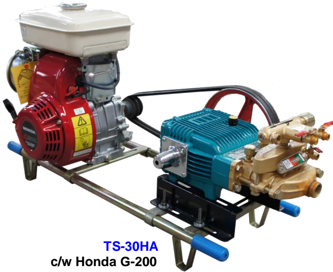
TS-30HA c/w Honda G-200