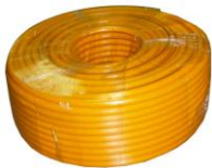
8MM HOSE x 100M