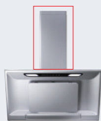
GFO-Duct Cover (Optional) (Only for FR-SC1790V / 1711V)