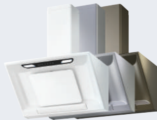
W (White)/SM (Silver Metallic)/ RS (Rich Silver)