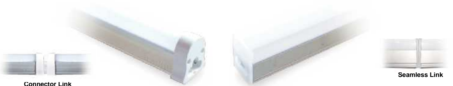
lumiTF Series LED T5 Tube