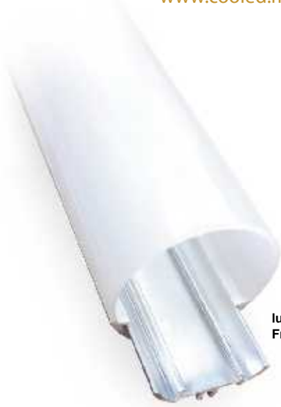
lumiTD Frosted Plastic Tube