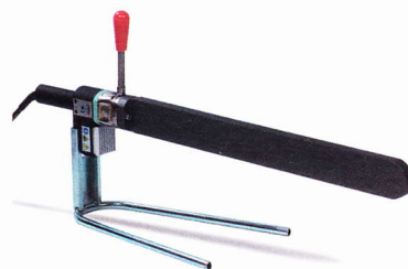
TP L 500