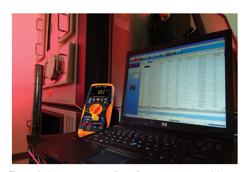
Figure 1. Automate recording of measurements with bundled GUI data-logging software.

Offering the same functionality as the U1252B, the U1253B is the world's first OLED handheld DMM. You won't have to squint to be sure you're reading it right: On the go or on the bench, you'll get crystal-clear viewing indoors, even in dark, off-angle situations.