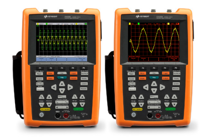
World's first VGA display handheld oscilloscope with two isolated channels