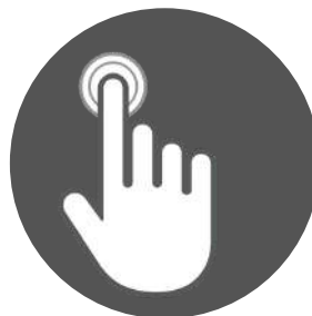
Digital Touch Screen