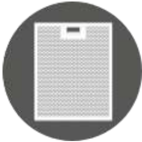
Washable Aluminium Filter