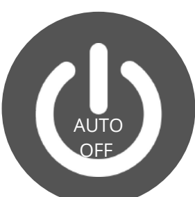
Auto Shutdown Protection