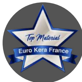
Top Material Euro Kera France