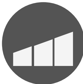
9 Power Levels