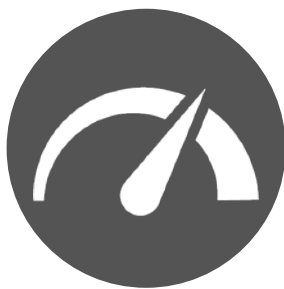
Adjustable 3 speeds level