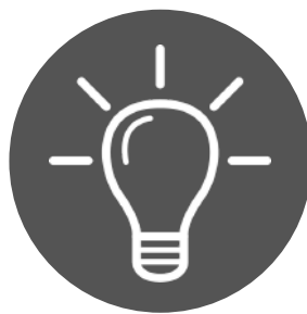
High Efficiency LED Lighting