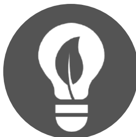
Energy Saving & High Efficiency