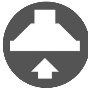
Effective Removal of Grease, Smoke & Smell