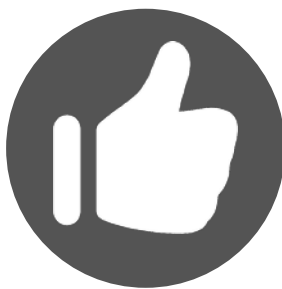
High Quality SUS 430 Stainless Steel with 6mm Tempered Glass