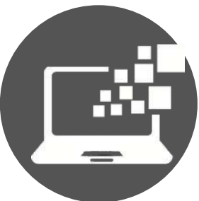
German E.G.O Technology