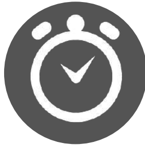
Delay Timer 5 mins