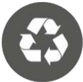
Ventilated / Circulated (Optional)