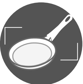
Pan Recognition Function