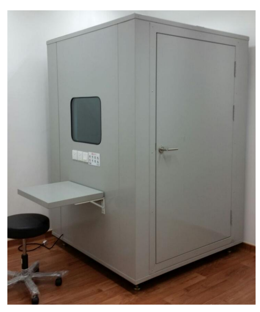
ISTIQ Standard Booth -Fabric

ISTIQ Audiometric Booth offer the best solutions to overcome the problems in audiometric tests. The room is designed to have adequate ventilation and lighting so the patient and tester will be comfortable during hearing evaluation.