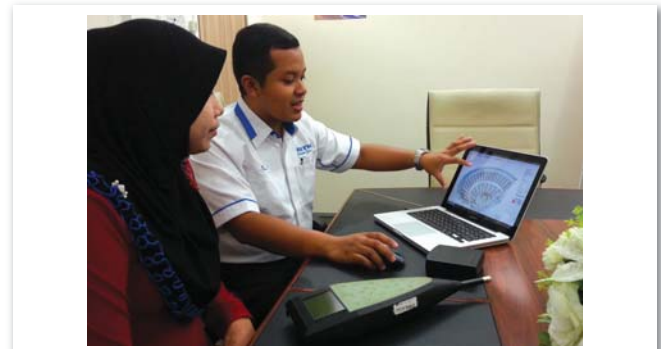
Visual Presentation by ISTIQ Acoustic Engineer using ODEON

ISTIQ NOISE CONTROL SDN BHD (Company No: 342283-V) Head Office: 28-2, Jalan Sri Permaisuri 9, Bandar Sri Permaisuri, Cheras, 56000 Kuala Lumpur. Tel: 03-9172 7205 / 9172 7206 Fax: 03-9172 7204 Email: enquiry.istiq@gmail.com website: www.istiq.net