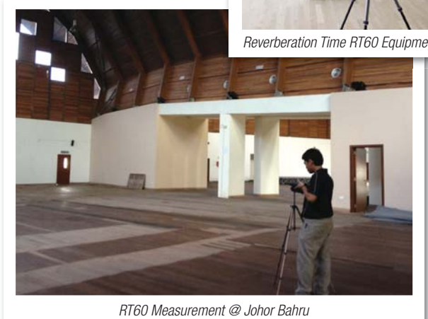
RT60 Measurement @ Johor Bahru