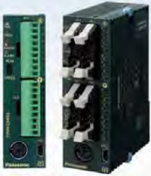
FP0R : Compact PLCs