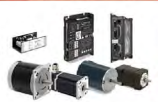
Stepper Motor & Driver