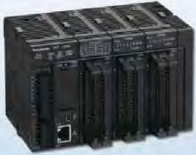
FP7 : Higher Efficiency