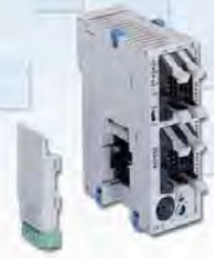
FP-Sigma : Powerful compact PLC