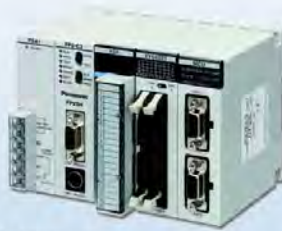
FP2SH : Modular high-speed PLC