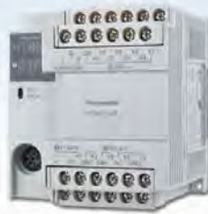
FP-X0: entry level, compact, multi-functional PLC