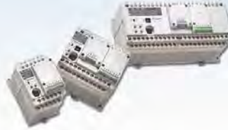
FP-X : Powerful PLC