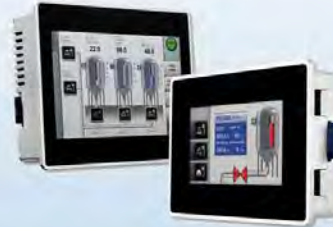
HM500 series touch terminals