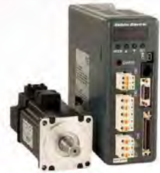
AC Servo Motor