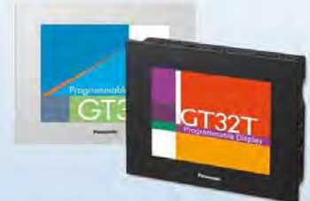
GT-series touch panels