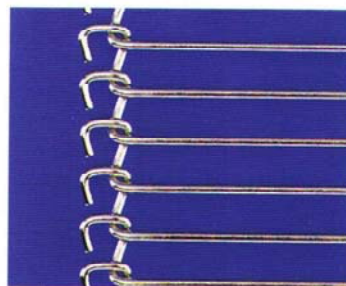
Selvage shape S