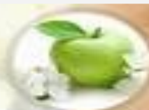
Green Apple Skin