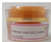
Whitening Cream with Coverage