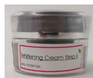
Whitening Cream Step II