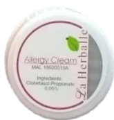
Soothing / Allergy Balm