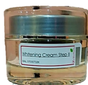
Whitening Cream Step II