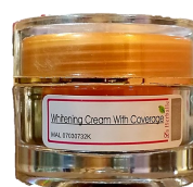
Whitening Cream with Coverage