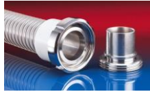
CONNECT MOULD ASSEMBLY 233