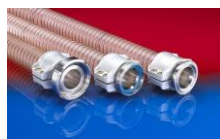
CONNECT SAFETY CLAMP ASSEMBLY 231