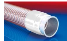
CONNECT 243 FOOD