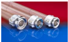
CONNECT SAFETY CLAMP ASSEMBLY 231