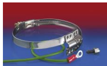
CLAMP 212 EC

Overpressure and underpressure are recommended threshold operating values, products can be subjected to higher loads upon request. The bending radius is measured through the inside of the hose arch. The right to make technical modifications is reserved. All values determined at 20°C and are approx.