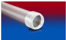
CONNECT 245 FOOD