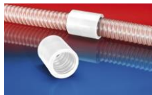
CONNECT 246 FOOD