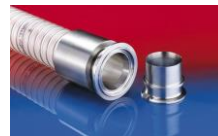
CONNECT PRESS ASSEMBLY 232