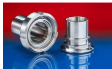
CONNECT ASEPTIC FITTING 249