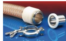
CONNECT TRI-CLAMP FITTING 245