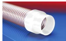
CONNECT 240 + 241 FOOD