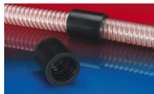
CONNECT 246 AS