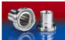
CONNECT DAIRY FITTING 247