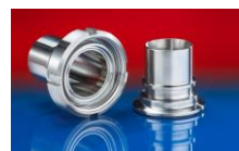
CONNECT ASEPTIC FITTING 249