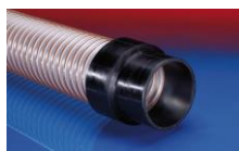
CONNECT 240 EC