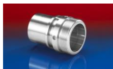
CONNECT THREAD FITTING 234