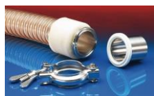
CONNECT TRI-CLAMP FITTING 245