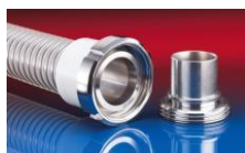
CONNECT MOULD ASSEMBLY 233