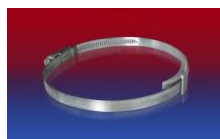
CLAMP 210 BRIDGE CLAMP