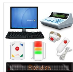
Proktoror II Wireless Nurse Call System