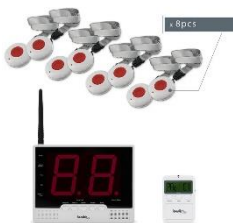
CMD-11 Flexicare Wireless Nurse Call System