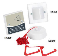
ESB901 Wired Disable Toilet Emergency Call System