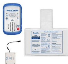
Bed Watcher - Fall Prevention system