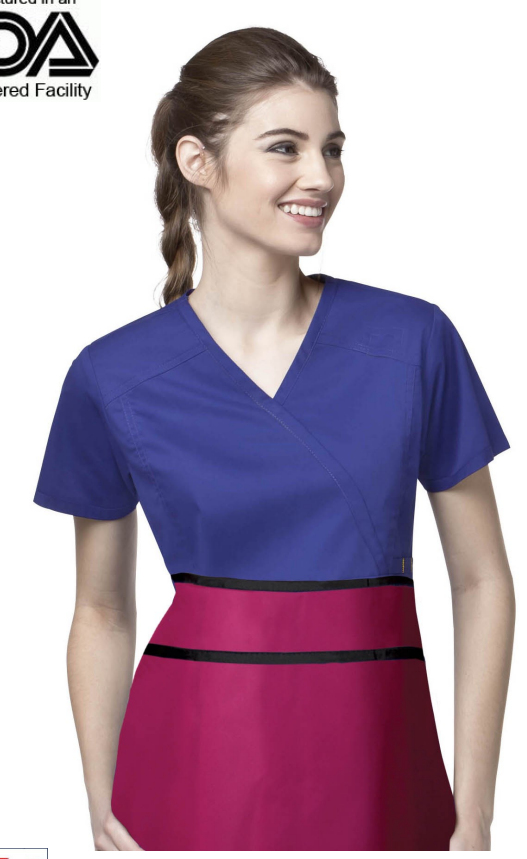
Semi Guard Hook & Loop Closure