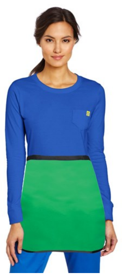
Lap Guard 1" buckle Closure

Techno-Aide Half Aprons are available in Small, Medium, Large, X-Large, 2X and Kids sizes. Your choice of buckle or hook & loop closure. All provide .5mm PB Equivalent protection. Belts are 27" long