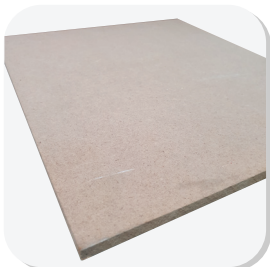
HDF Board Decking Material with 8mm thickness