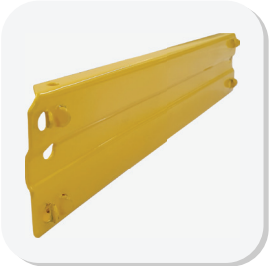
Twin Rivet C Beam (TRB) To provide ultimate strength and stability