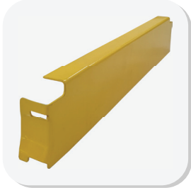
Center Support (CLS) To support center of decking material and against longitudinal deflection.

Y3 Display Boltless Rack minimizes set-up time and offers a vast selection of heavy to light racking system requirements. Easy and fast to install and dismantle, Y3 Display Boltless Rack can be applied to existing racking systems for increased cost savings in warehouse storage systems.