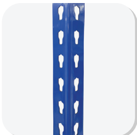
Angle Post with Rib (AP) New reinforced "Curvy Rib" to increase loading capacity and rigidity