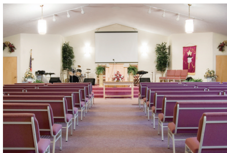
Houses of worship