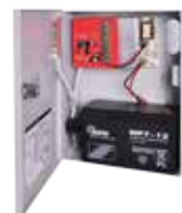
NVS1230P Power Supply