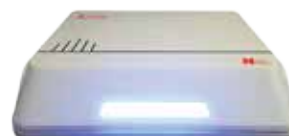
Blue Successful read card