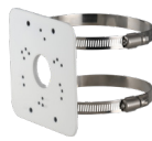
PFA152-E Pole mount