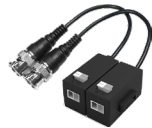
PFM800-E Passive HDCVI Balun