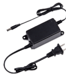
PFM320 12V 2A Power Adapter