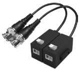
PFM800-E Passive HDCVI Balun