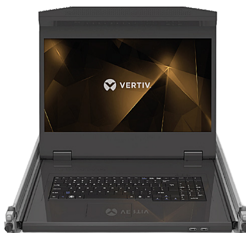
Vertiv 18.5" CLRA Local Rack Access Console

You understand how valuable data center real estate can be. A crowded server rack can make your job a lot harder. The CLRA Console is available with pre-integrated 8- and 16- port KVM that seamlessly fits into the same 1U the LCD tray is occupying, providing vastly improved utility while conserving space.