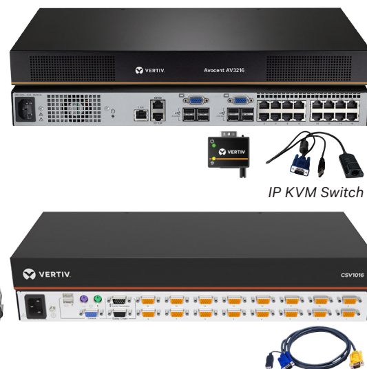
Analog KVM Switch