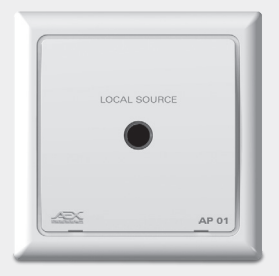
AP 01 Local Source Patch Panel