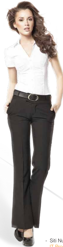
- Siti Nurul IT Programmer

Austin 18 is my office, vacation spot, workstation...it's basically anything and everything I want it to be.