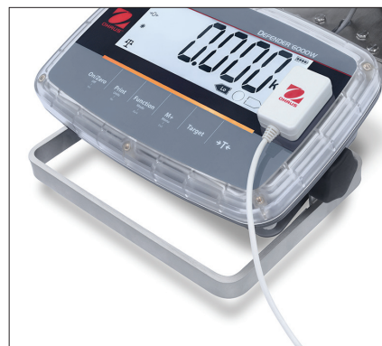
Optional IR RS232 kit for i-D61PW model