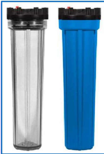
Figure 2 : The SYSFLO 1CB2 Series Plastic Filter Housing with either Clear (Transparent) Sump or Opaque (Blue) Sump