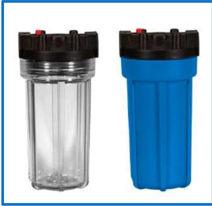
Figure 1 : The SYSFLO 1CB1 Series Plastic Filter Housing with either Clear (Transparent) Sump or Opaque (Blue) Sump