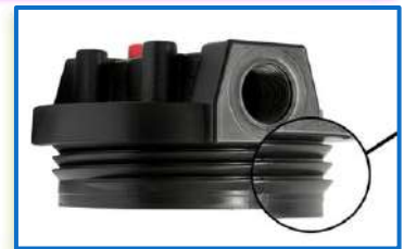
Superior "Buttress" Thread Seal Design